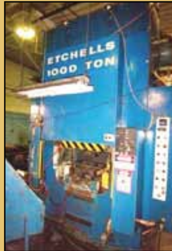
1000 Ton Etchell Mdl. 1000CP Coining Press