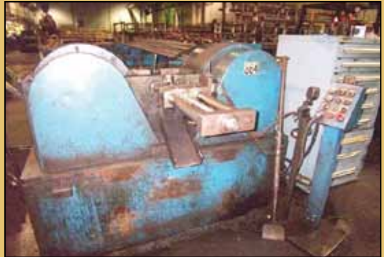
Fenn #125 Impact Cut-Off Shear with Barfeed