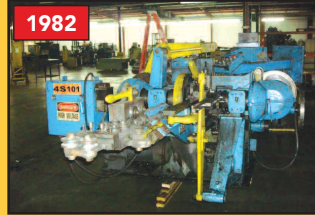
NILSON MDL. #S5 WIRE FORMER