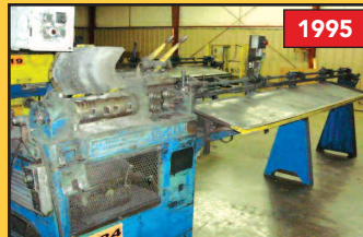
LEWIS MDL. 2SV5 STRAIGHT & CUT MACHINE

CNC WIRE BENDING AND FORMING EQUIPMENT, OBI & STRAIGHT SIDE PRESSES, TUBE BENDERS, CNC ROBOTS, MACHINE SHOP EQUIPMENT