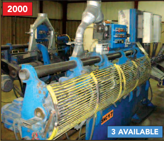
(3) RMG MDL. 16 STRAIGHT AND CUT MACHINES