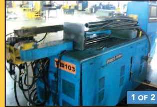
(2) PINES TUBE BENDER