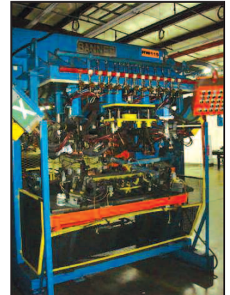
BANNER RESISTANCE WELDER