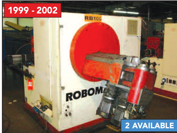
ROBOMAC MDL. 213 CNC WIRE FORMER