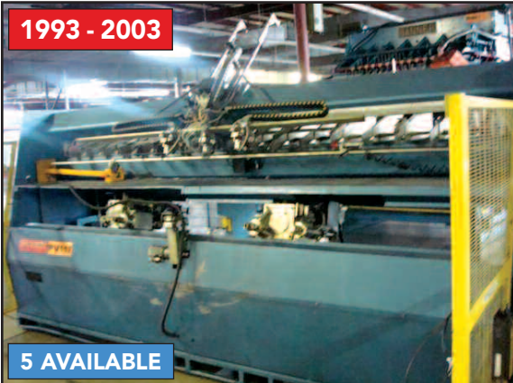
PAVE CNC WIRE FORMERS