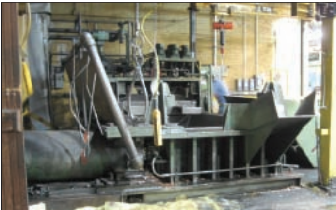
SCRAP BALER CHARGING BOX 44" (1117mm) X 96" (2438mm) x 22" (558mm) DEEP