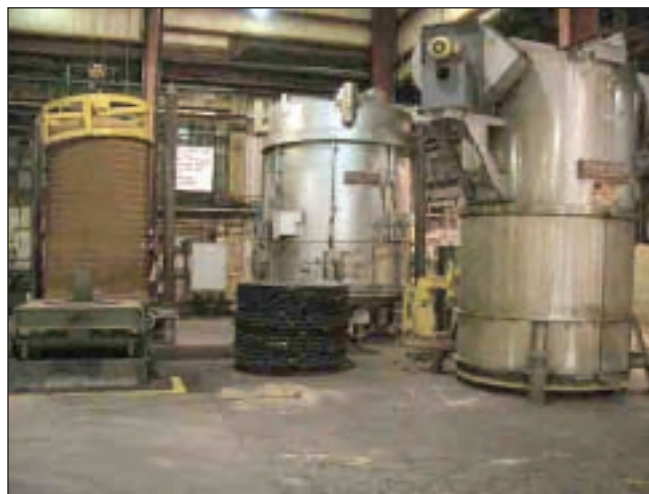
RAD-CON BELL ANNEALING FURNACE NEW 1993