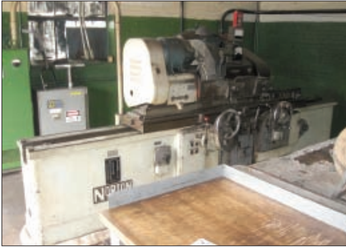
10" X 48" (254mm x 1219mm) NORTON ROLL GRINDER

All Specs Subject to Physical Inspection Verification – Please Call to Set Up Inspection Appointment