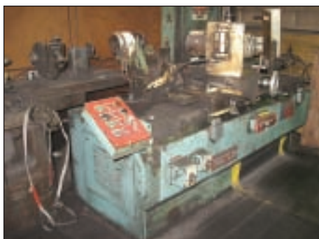
SETCO CUTTER GRINDER MOD. SMGY-34 (2 AVAILABLE)