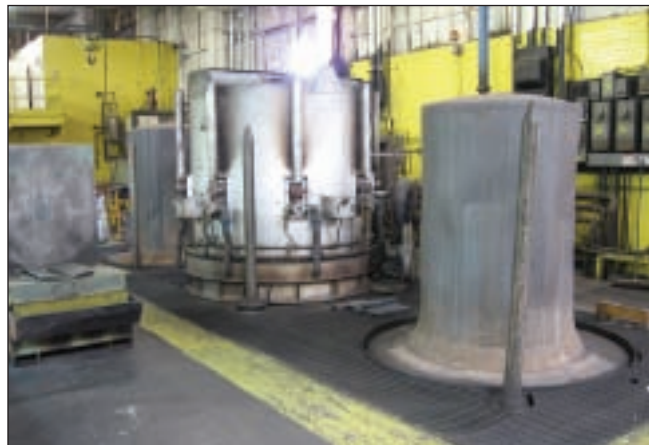
LEE WILSON BELL ANNEALING FURNACE CELL