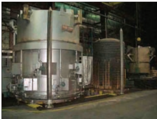
RAD-CON BELL ANNEALING FURNACE NEW 2001