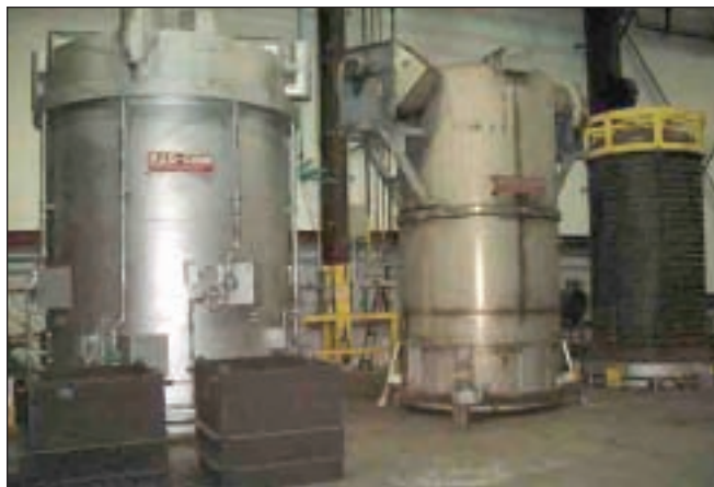
RAD-CON BELL ANNEALING FURNACE NEW 1998/2001