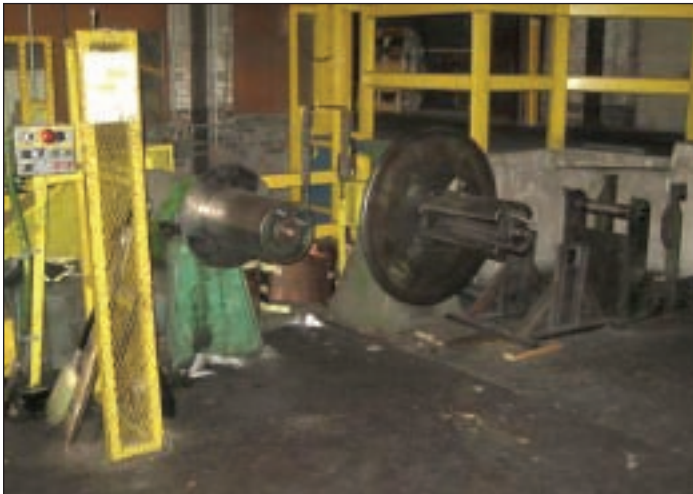
COIL REWIND LINE (2 AVAILABLE)