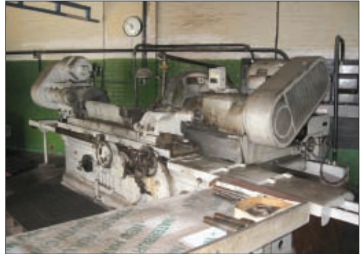
14" X 48" (355mm x 1219mm) NORTON ROLL GRINDER